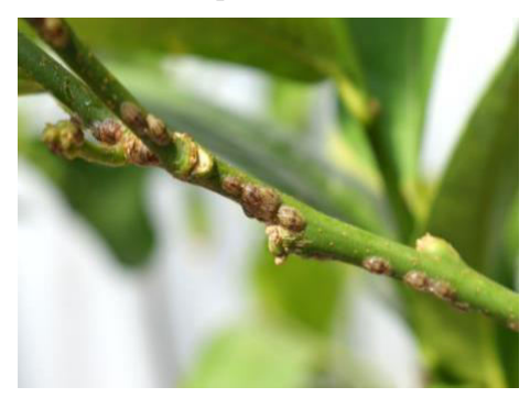
Fig3. Brown scale spot

2. Disease found in Stem: Stems of the plants are infected by insects, pests and caterpillars. Caterpillars feed within the stem of growing plant and may cause enough damage at the growing points of the plant stems. This results in brown holes, sheath smut, red stip. Plants like apple ( black stipe, brown spot), sugarcane ( sheath smut, red stipe), pigeon pea (root rot), tomatoes ( pith necrosis) etc.