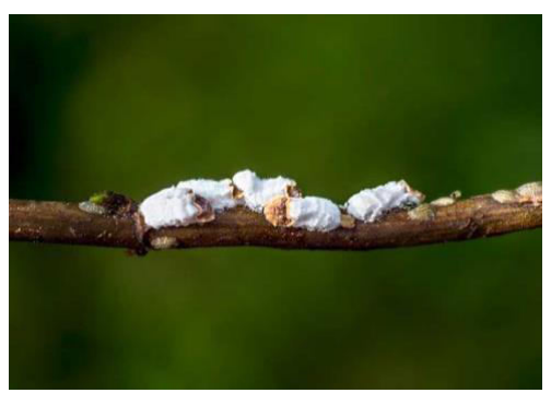
Fig4. Mealybugs infected stem