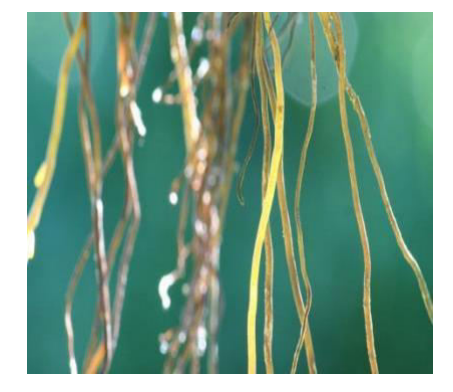
Fig2. Root Rot

2. Disease found in Stem: Stems of the plants are infected by insects, pests and caterpillars. Caterpillars feed within the stem of growing plant and may cause enough damage at the growing points of the plant stems. This results in brown holes, sheath smut, red stip. Plants like apple ( black stipe, brown spot), sugarcane ( sheath smut, red stipe), pigeon pea (root rot), tomatoes ( pith necrosis) etc.