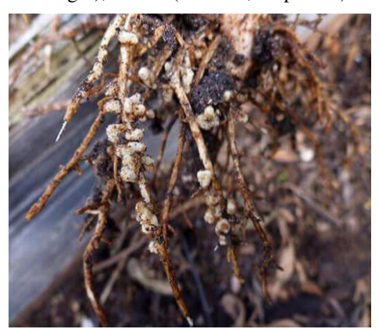
Fig1. Sclerotinia blight

1. Diseases found in root of Plant: The disease that infect the roots of plants are root infected disease. And it occur basically in plants such as Chickpea( dry root rot, Ascochyta blight), Rice (Leaf blast, brown spot, leaf blight), Wheat (leaf rust, stripe rust) etc.