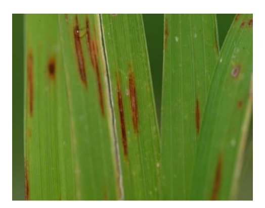
Fig6: leaf blast

K- Means is very effective and simple technique for detection of infected area. This algorithm is basically applied for separating foreground and background images to identify infected leaves in plant. Some of the common leaf diseases are potato (leaf blight, early blight), wheat (leaf rust), rice ( leaf blast, brown spot, leaf blight) etc.