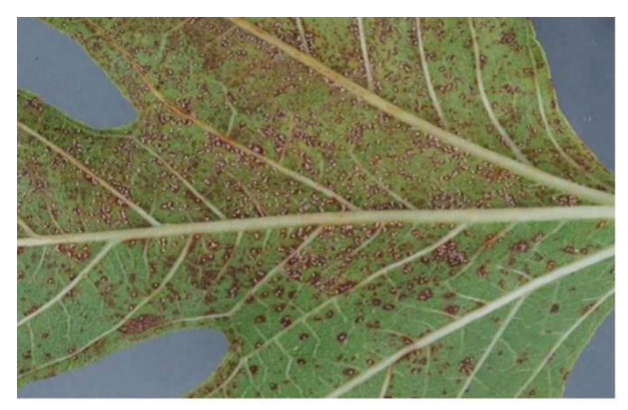
Fig8: Brown Bumps