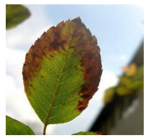
Fig7: Brown spot